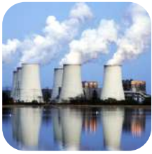
Nuclear Power Plant